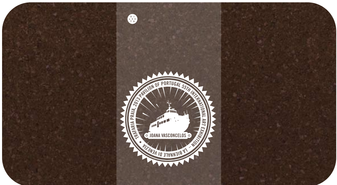
Size of the box: 16 x 60 x 34 cm

Cork is a natural product of which Portugal is the main producer and exporter in the world. Cork is nowadays mostly known around the world through its use as a stopper for wine bottles, but has various other uses, from architecture to furniture, as can be seen in the Trafaria Praia ferryboat. Here the cork represents the natural element associated with the industrial (the ferryboat), to underline a contemporary approach.